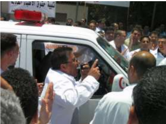
Physician's sit-in in 2011