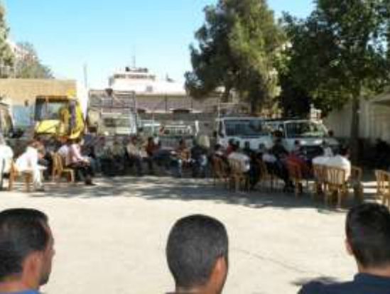
30/11/2010, strike at the Water Undertaking for the implementation of the collective agreement