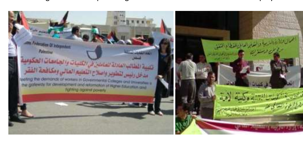
Governmental Colleges and Universities Employees Federation protests in 2010 & 2009