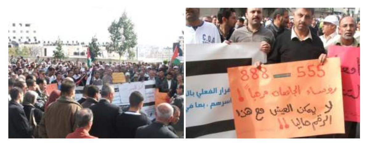
University professors demonstration in Ramallah on 18/11/2008 The banner of one of the protestors reads "555-888, hello presidents of universities! We cannot live on this amount!

<sup>10</sup> Link to the agreement for the new unified employees classification system in force as of 1/9/2008 http://www.najah.edu/ar/node/30645