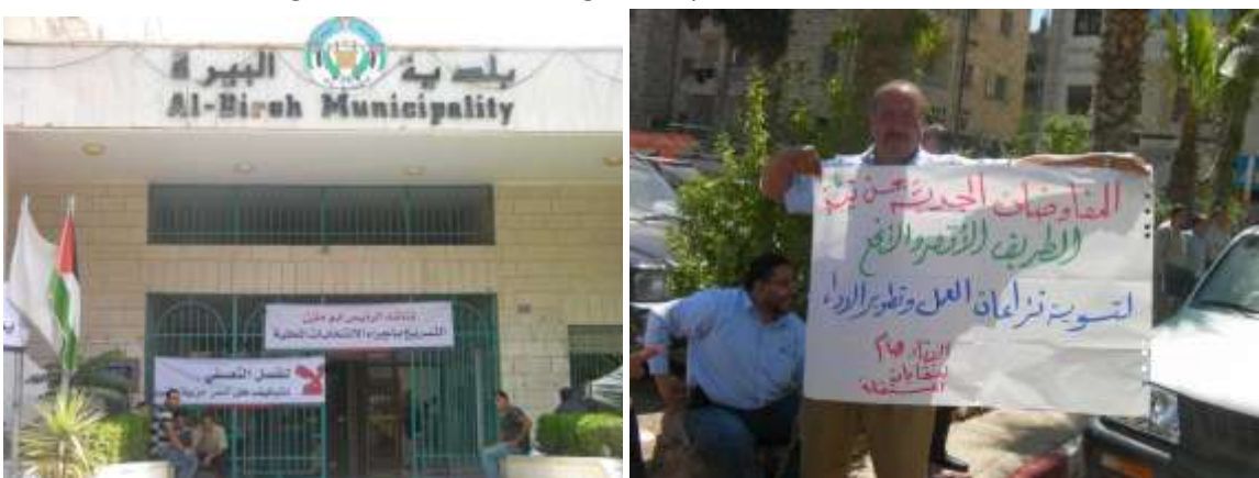
Strikes in Al-Bireh and Ramallah municipalities in 2011

Local authorities is one of the sectors were collective bargaining takes place on a regular basis, and where several agreements have been signed in past years at workplace level. In many municipalities and local councils, employees have formed unions and workers' committees, which generally undertake regular elections although the process might be politicized, in particular in bigger municipalities. In principle, employees of municipalities and local authorities do neither fall under the scope of the Palestinian labor law, nor under the scope of the civil service law. In the past, various categories of employees in the same municipality used to be subjected to different employment regimes and statutes, leading to blatant discriminations. On 30/3/2009, the Council of Ministers adopted a regulation for local authorities' employees, which specifies their individual rights and duties. It was scheduled to be gradually applied to all municipalities and local councils through successive stages over a two year period, and to replace all former legislation thus unifying the legal framework. This adjustment period led to labor conflicts in several municipalities over the implementation of the new legislation, and employees' unions have also engaged in bargaining for additional rights. In 2011, 7 labor disputes were registered by the Ministry of Labor in this sector. Several municipalities have collective work agreements, including Qalqilia, Anabta, Al-Bireh and Betunia.