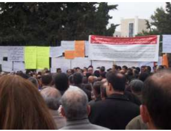
Public sector employees sit-in in April 2008 to protest the law on public sector strikes

Although its article one stipulates that governmental workers have the right to strike, article 2 subjects strikes to the conditions set in article 67 of the Palestinian labor law and article 3 gives the right to the government or any other party to appeal to the High Court of Justice to order the end of a strike that violates this law or causes "severe damage to public interest". This law has been used on several instances in attempts to stop strikes in the public sector, including against physicians on strike in 2011.