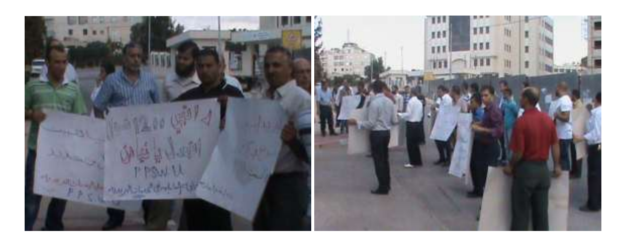
Postal workers sit-in in front of the Council of Ministers in 2012 organized by the Postal Service Workers' Union, an affiliate of the General Union of Independent Trade Unions in Palestine; one of the signs reads: "My salary is 1200 NIS, would you switch with me Fayyad?"