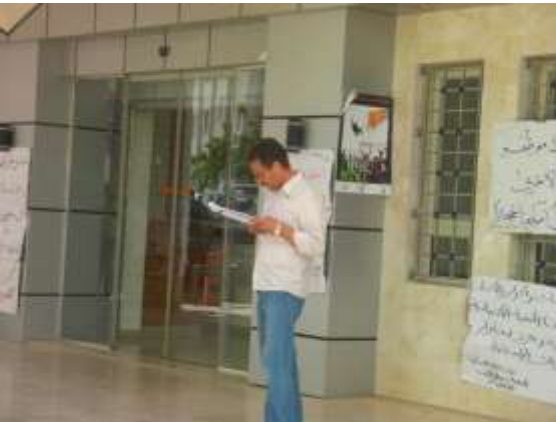
Year 2011 protest movement and strike at the Investment Bank